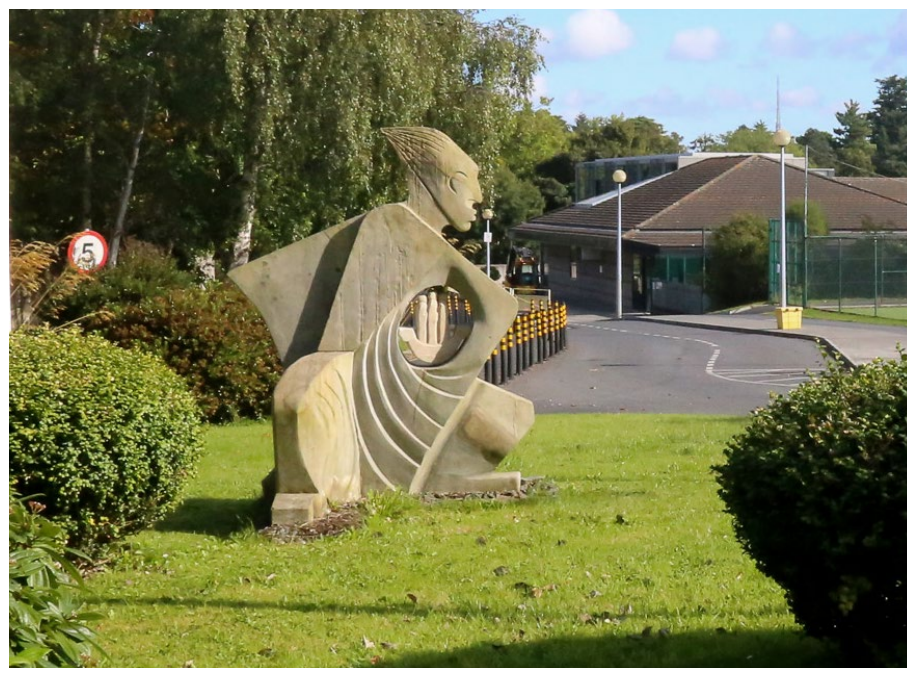
Printed on recycled paper